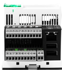
additional current input view