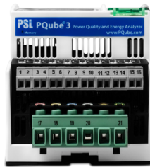
voltage/current input view